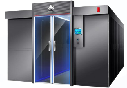
Standard Dual- row

Furthermore, the Huawei smart module uses the i 3 intelligent management to comprehensively improve the reliability and efficiency of power supply and cooling system. This significantly improves data center availability and O&M efficiency.