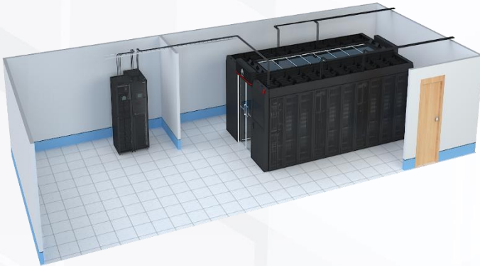
UPS Outside the Module(Precision PDC )