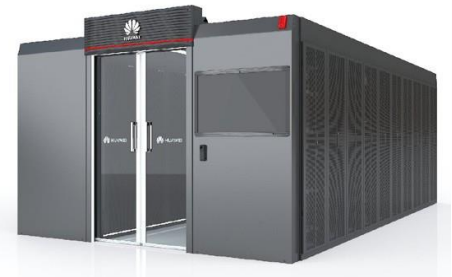
Standard Dual-row Smart Screen Version*