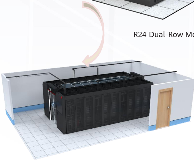
UPS Inside the Module(Integrated UPS+SmartLi )