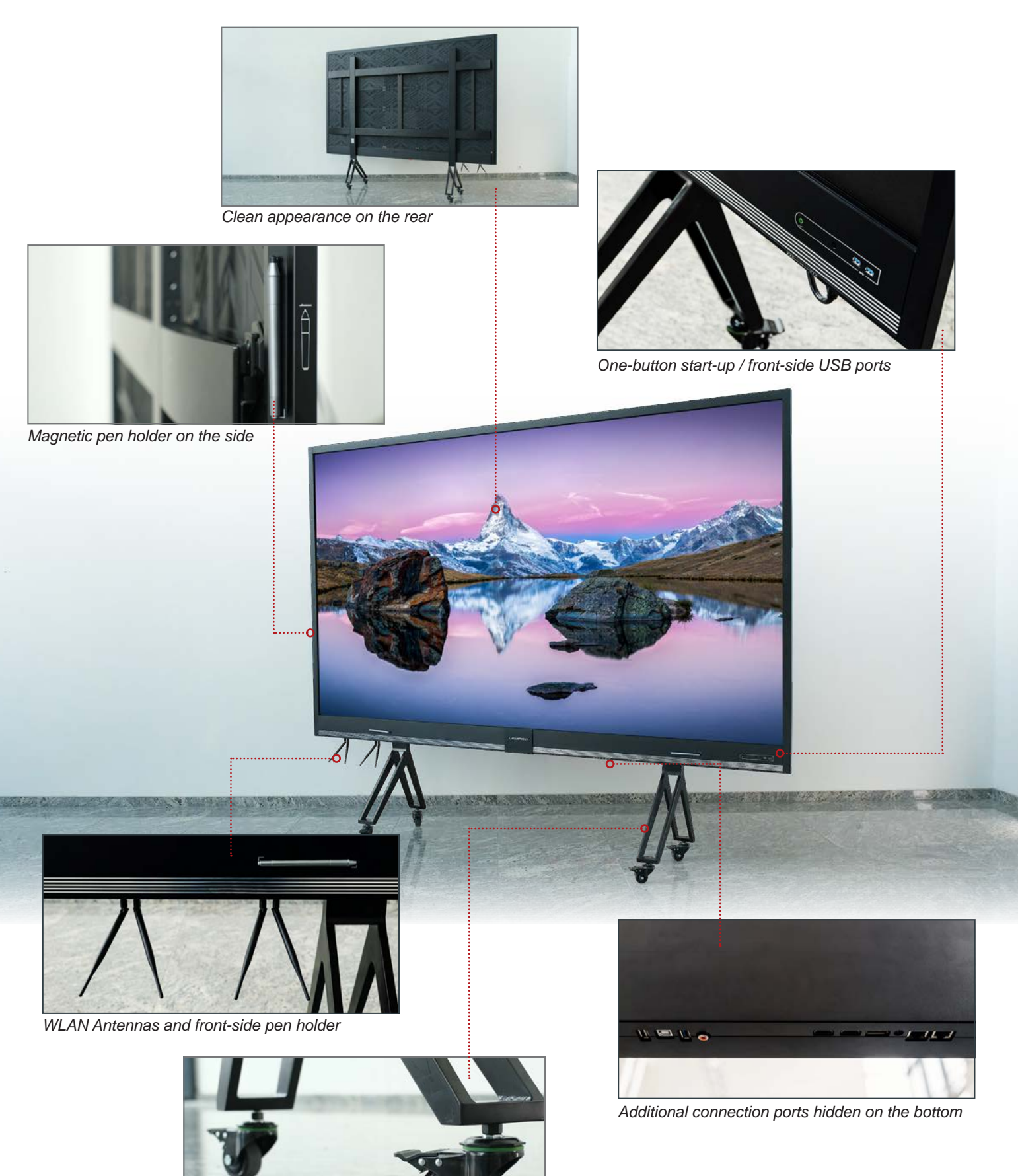
Robust base on castors for mobile use

The all-in-one design of the Leyard TXP Series Huddle Walls combines the fantastic image properties of our LED technology with a chic design that has been developed without sacrificing functionality or visual appeal.